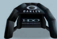
Infl. Tent 4x4