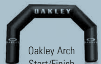
Oakley Arch Start/Finish Entrance/Exit