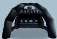
Infl. Tent 4x4