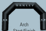
Arch Start/Finish Entrance/Exit